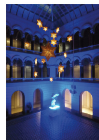
Main entrance Lichthof